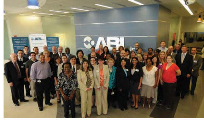
ABL is a leading contract research and manufacturing organization, partnering with our clients to advance their vaccine and therapeutic development programs.

The ABL team has many years of experience producing cell banks for clinical programs. Let us work with you, utilizing our expertise, to generate a cost-effective strategy to meet your cell banking requirements: from cell line development and optimization to manufacture and inventory management.